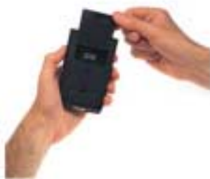
Figure 2. Rear View of Handspring Visor, showing Springboard Expansion Slot and Card (Handspring 2001a)

The PDA hardware add-on module extends the capabilities of the standard PDA to support the unique features of IPS. Prototyped on the Springboard expansion slot of the Visor line of PDA, the hardware add-on module itself contains all the software required for its operation. Shaped as a slim card as in Figure 2, springboard modules slide into a slot in the Visor PDA. Modules can take on various shapes and sizes as required, as seen in Figure 3. Modules for other popular PDAs such as Palm III may be built in the future.