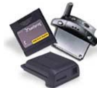
Figure 3. Other springboard modules currently available (Handspring 2001a)